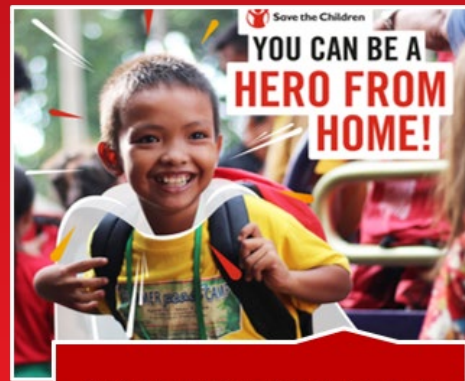
SHIFTING TO DIGITAL