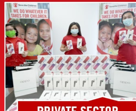
PRIVATE SECTOR PARTNERSHIP