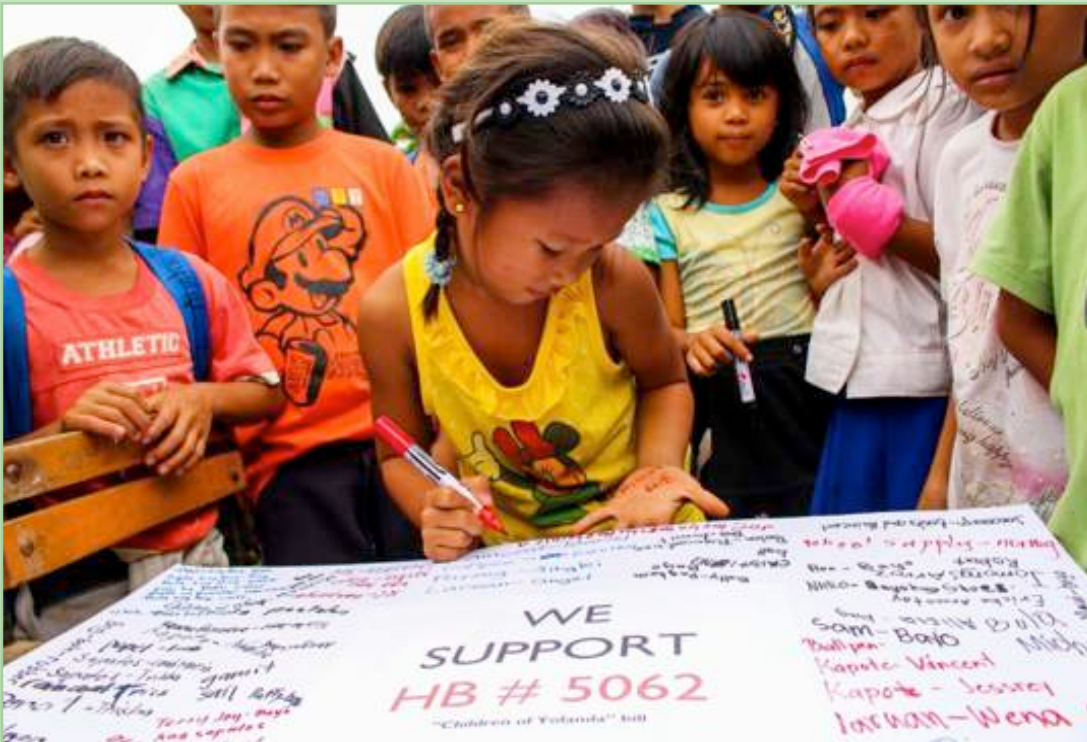
Grades 1-3 of Sta. Fe Elementary School in the municipality of Pilar (Capiz), gather together to show support in the "Children in Emergencies" bill. They write down their experiences, losses and learnings when Typhoon Haiyan (Typhoon Yolanda) hit.

Before pursuing the advocacy for the Children's Emergency Relief and Protection bill, Save the Children did extensive research to ensure that opinions of children and communities were documented. This was held from 13-27 September 2014. Interviews and consultations were conducted in Yolanda-affected areas that are part of Save the Children's areas of operation such as Iloilo and Leyte. 162 children were consulted in 12 consultation groups. Children were asked to rate the Haiyan response and were also asked about their future priorities. This activity/research was able to document various findings and recommendations which included: