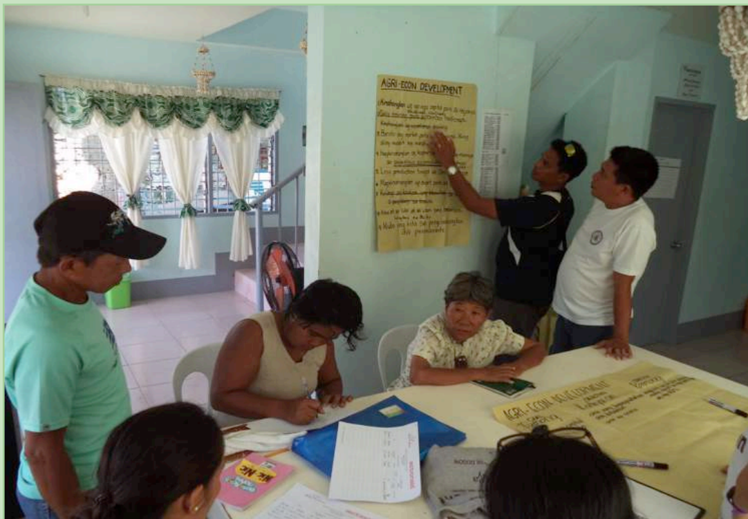
Balay Mindanaw facilitates the BDP process in Brgy. Tabgas, Albueria, Leyte with the Barangay Development Council

Balay Mindanaw Foundation, Inc., one of ActionAid partners conducted a Barangay Development Planning (BDP) as a process that engages and empowers local communities to identify priority projects that will address the needs of the most vulnerable sectors in the communities including women, children, PWD, elderly, etc., and crafted the Barangay Development Plan, and lobbied for support to duty bearers and various stakeholders to implement priority projects within the next 5 years.