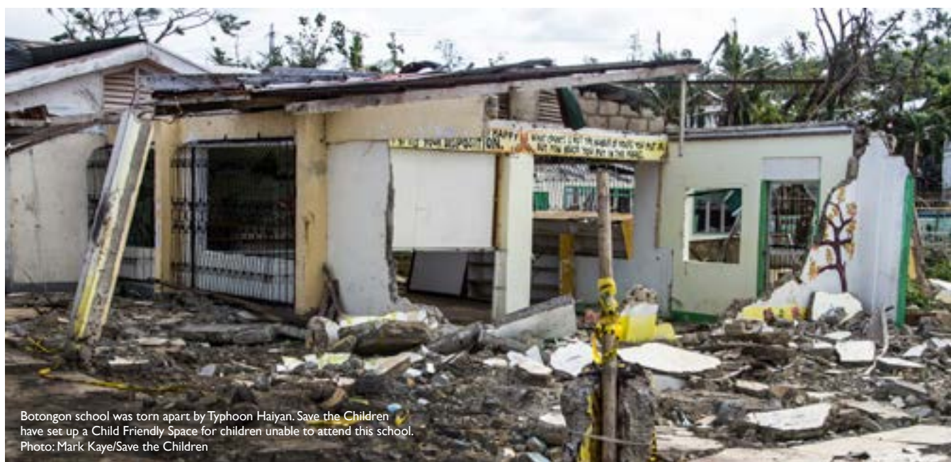
Botongon school was torn apart by Typhoon Haiyan. Save the Children have set up a Child Friendly Space for children unable to attend this school.