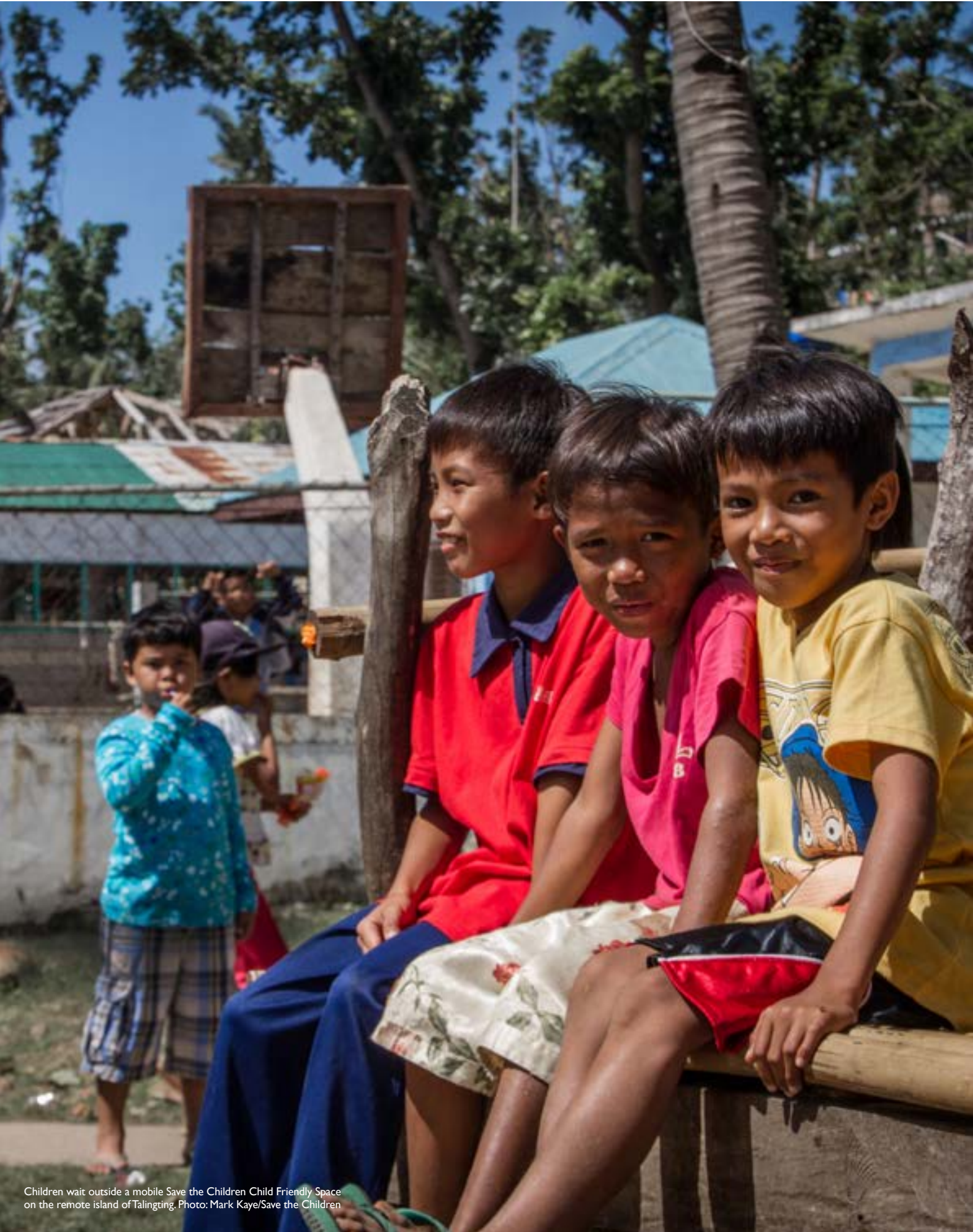
Children wait outside a mobile Save the Children Child Friendly Space on the remote island of Talingting.