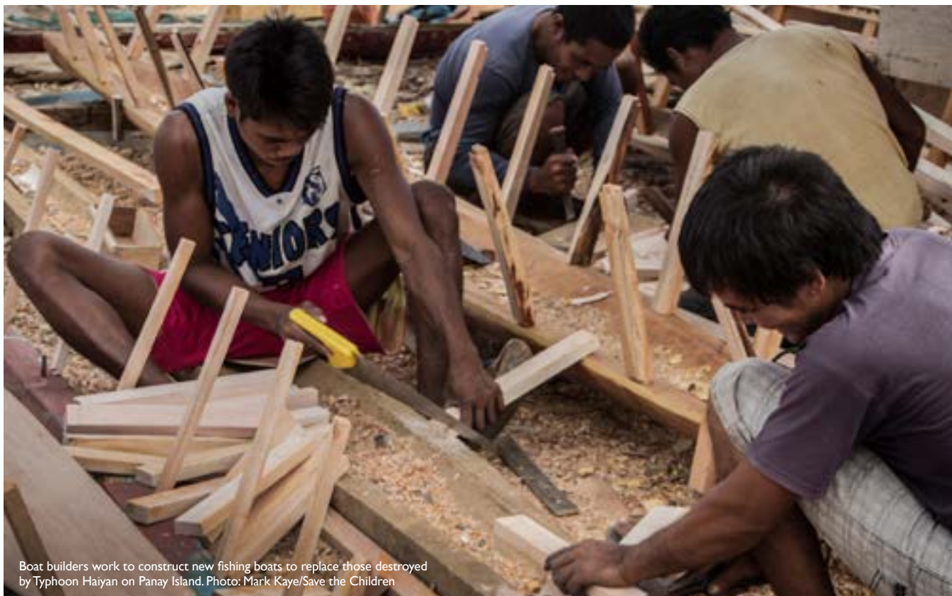
Boat builders work to construct new fishing boats to replace those destroyed by Typhoon Haiyan on Panay Island.